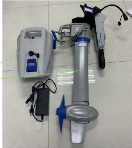
Spirit 1.0 Plus has 2 big parts: motor and battery. The tiller is integrated with the motor.