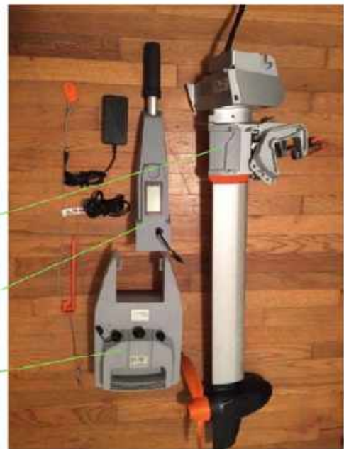
Travel 1103C has 3 big parts: motor, tiller and battery.